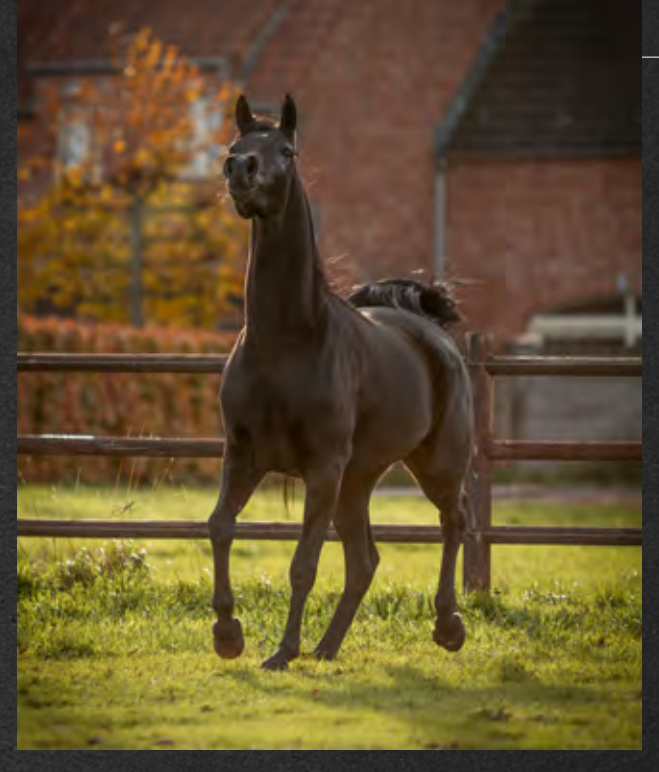
Fandi (Wadee Al Shaqab x Fudjizama)